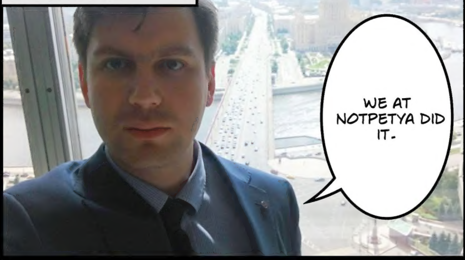
MEANWHILE AT NOTPETYA'S HQ---